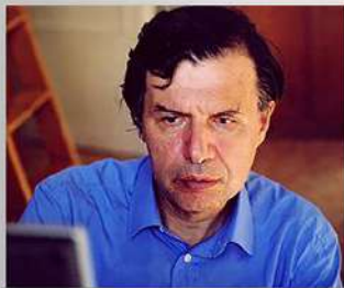
Giorgio PARISI Nobel Prize in Physics (2021) Sapienza University of Rome Italy